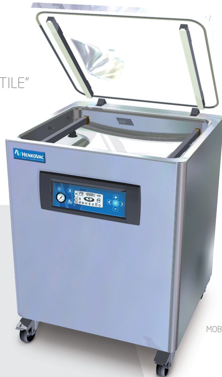
MOBILE M1, M2, M3