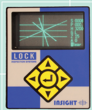
DDS (Direct Digital Signal)