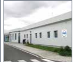
Plzen, Czech Republic