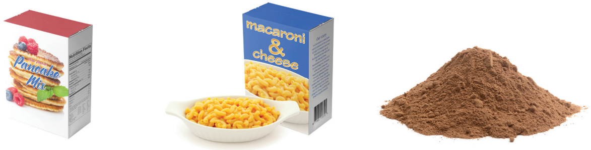
Example of conveyed products

Vacuum conveying is widely used in this industry and often used to feed dosing equipment or a sieve, mixer/blender or a dosing machine. It can also feed packaging machines and reclaim from packaging and other machines.