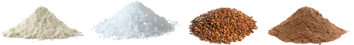
Example of conveyed material

The end products are normally bread, short cakes, tortillas, cookies, crackers, breakfast cereal and muesli, etc. The most common application for vacuum conveying is to feed various kinds of sugar, salt, flour or similar material via sieves into blenders and mixers. Vacuum conveying is also used to feed dosing equipment which sprinkles flavoring, seeds or salt on top of various kinds of breads or buns, or to feed packaging machines and reclaim from packaging and other machines.