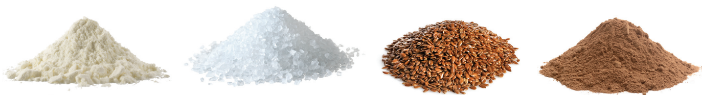
Example of conveyed material

The end products are normally bread, short cakes, tortillas, cookies, crackers, breakfast cereal and muesli, etc. The most common application for vacuum conveying is to feed various kinds of sugar, salt, flour or similar material via sieves into blenders and mixers. Vacuum conveying is also used to feed dosing equipment which sprinkles flavoring, seeds or salt on top of various kinds of breads or buns, or to feed packaging machines and reclaim from packaging and other machines.