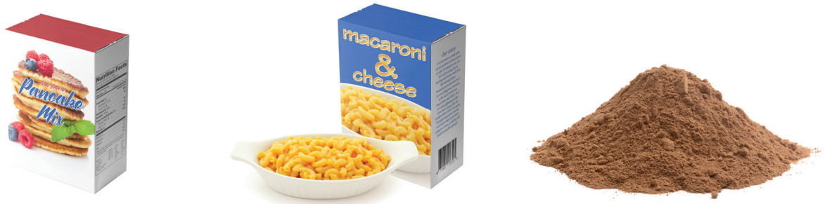
Example of conveyed products

Vacuum conveying is widely used in this industry and often used to feed dosing equipment or a sieve, mixer/blender or a dosing machine. It can also feed packaging machines and reclaim from packaging and other machines.