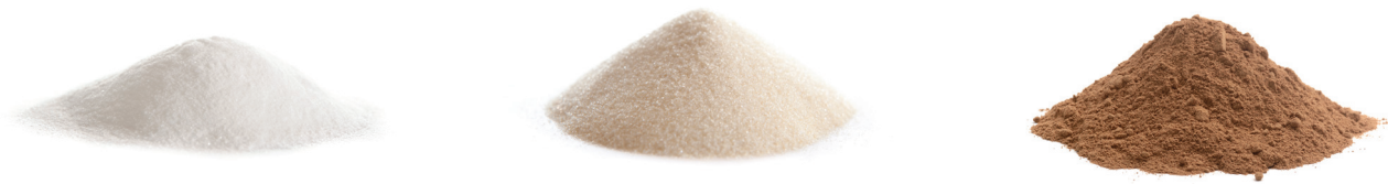
Example of conveyed products

Vacuum conveying is widely used in this industry and often used to feed dosing equipment or a sieve, mixer/blender or a dosing machine. It can also feed packaging machines and reclaim from packaging and other machines.