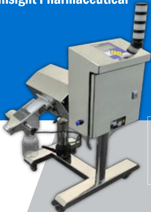
Insight Pharmaceutical metal detector with DDS.

Best-in-class out-of-box detection for all types of metal fragments. The height adjustable frame with robust clamping sleeve allows for easy integration with all leading tablet presses and encapsulation machines.