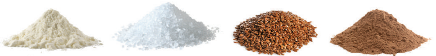
Example of conveyed material

The end products are normally bread, short cakes, tortillas, cookies, crackers, breakfast cereal and muesli, etc. The most common application for vacuum conveying is to feed various kinds of sugar, salt, flour or similar material via sieves into blenders and mixers. Vacuum conveying is also used to feed dosing equipment which sprinkles flavoring, seeds or salt on top of various kinds of breads or buns, or to feed packaging machines and reclaim from packaging and other machines.