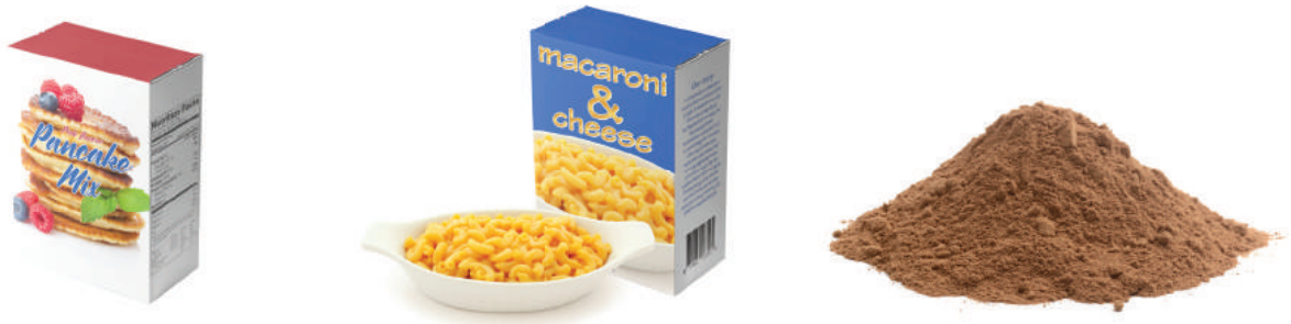
Example of conveyed products

Vacuum conveying is widely used in this industry and often used to feed dosing equipment or a sieve, mixer/blender or a dosing machine. It can also feed packaging machines and reclaim from packaging and other machines.