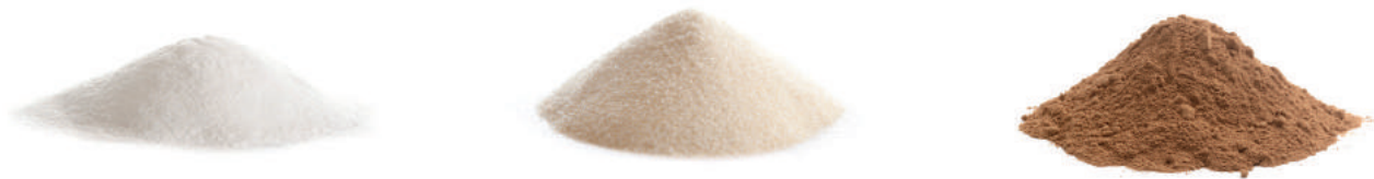
Example of conveyed products

Vacuum conveying is widely used in this industry and often used to feed dosing equipment or a sieve, mixer/blender or a dosing machine. It can also feed packaging machines and reclaim from packaging and other machines.