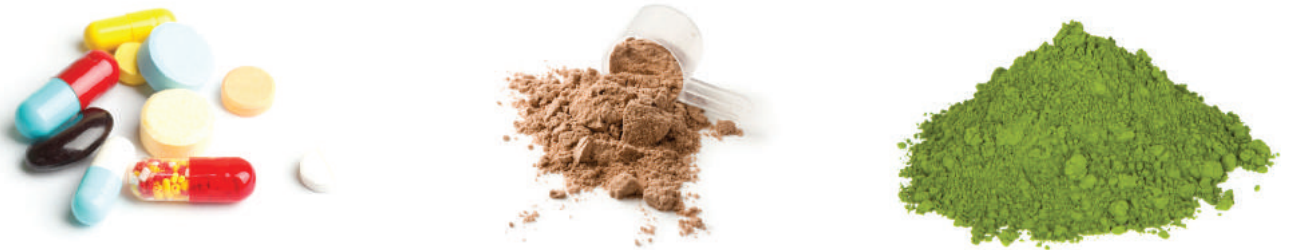
Example of conveyed material

The most common applications are to feed packaging machines with finished product (typically protein powders), tablet presses and capsule filling machines with blended powders, and blenders/mixers with ingredients.