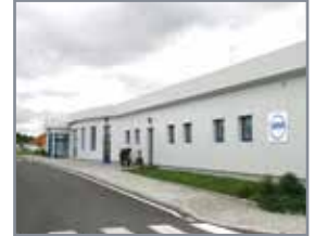
Plzen, Czech Republic