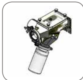
Wash in place