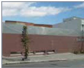
Sao Paulo, Brazil