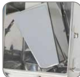
Cowbell Diverter Reject