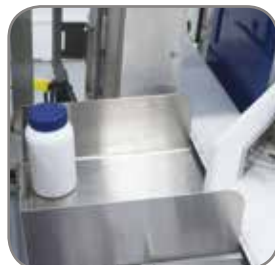
Stainless Steel Reject Tray

The Insight BottleChek is available with different reject options: A Reject Tray where rejected product is pushed off the production line into a stainless steel tray, a standard, lockable reject bin or a side-by-side transfer to another conveyor belt.