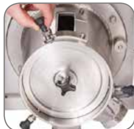
Sealed Valve Reject

There are two different reject systems available to ensure contaminants are safely and reliably rejected from the production line. The Sealed Valve Reject is completely dust-tight thus eliminating any cross contamination. The Cowbell-type diverter style reject will reject contaminated product into a separate reject bin.